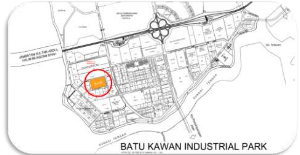
Location: Penang Mainland