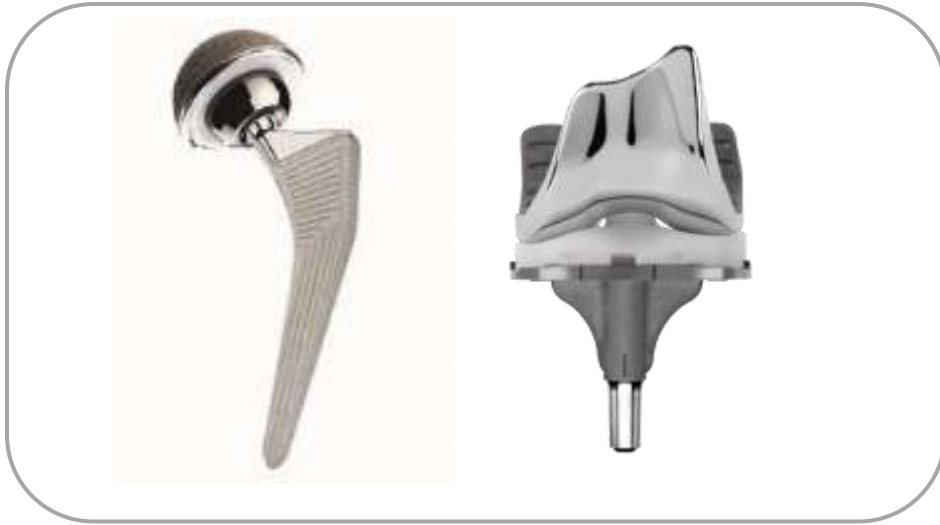
Products: Hip and Knee Replacements