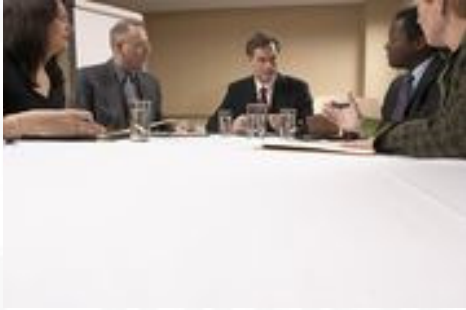
Presentation to the Internal Approval Committee