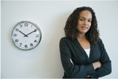
30 Days Commence